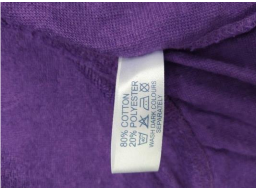
BACK SIDE LABEL VIEW