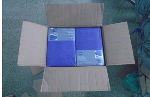
OPEN CARTON VIEW