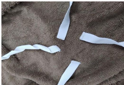
STRINGS VIEW WITH EDGES