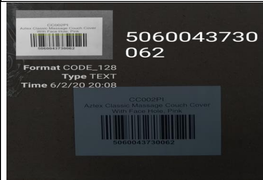
BARCODE SCANNING VIEW