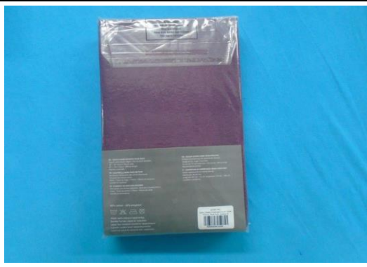
PACKED PIECE BACK VIEW