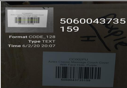
BARCODE SCANNING VIEW