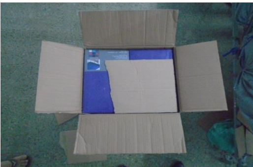
OPEN CARTON VIEW