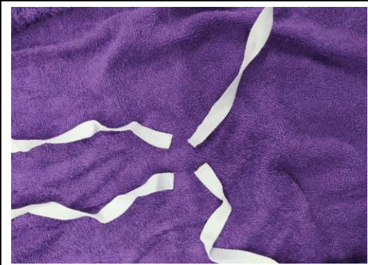
STRINGS VIEW WITH EDGES