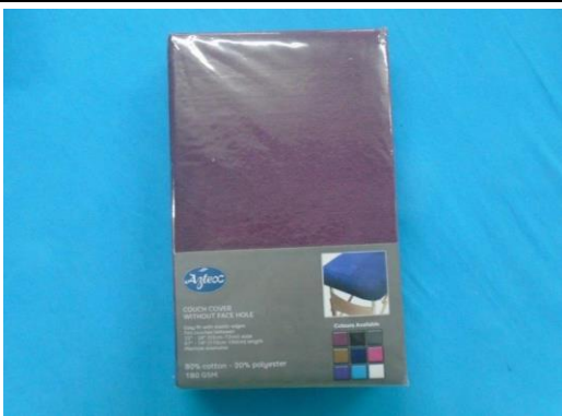
PACKED PIECE FRONT VIEW