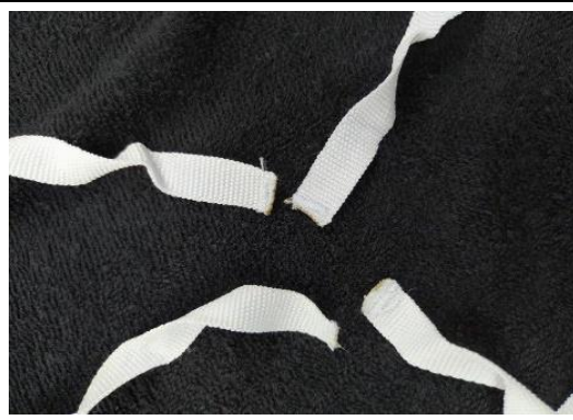
STRINGS VIEW WITH EDGES