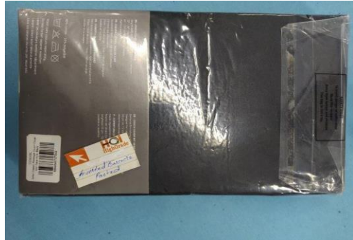
INVERTED BARCODE PASTED