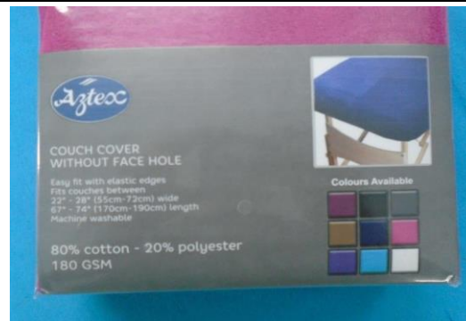
FRONT INSERT VIEW