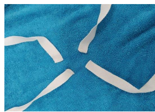
STRINGS VIEW WITH EDGES