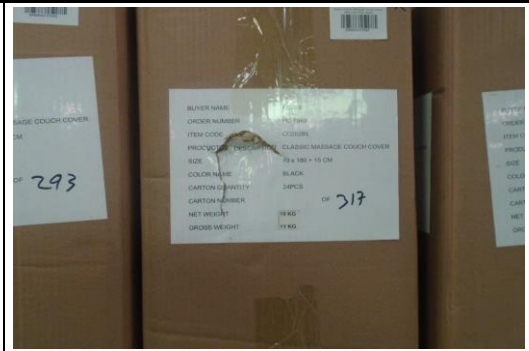
DAMAGE SHIPPING MARK