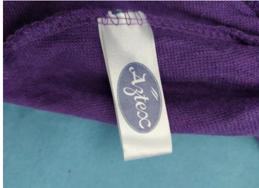
FRONT LABEL VIEW