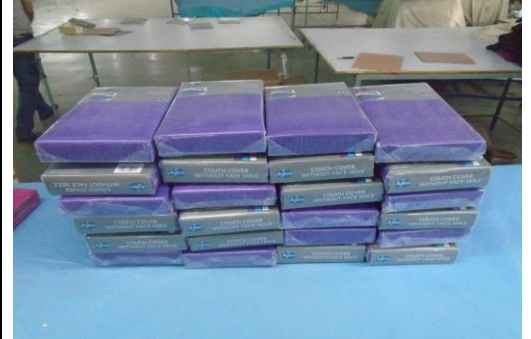
PACKED PCS OUT OF CARTON VIEW