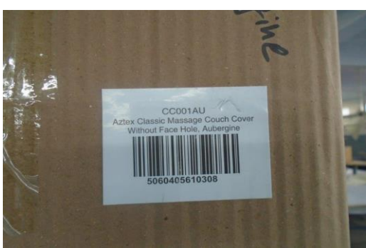
CARTON BARCODE VIEW