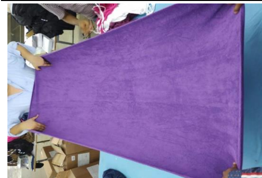
WITHOUT HOLE PC OPEN VIEW