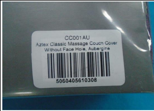
BARCODE VIEW ON PACKED PC