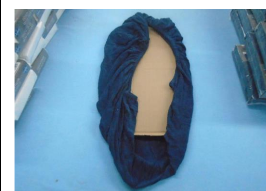
OUT OF POLYBAG VIEW WITH STIFFENER