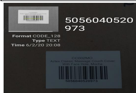
BARCODE SCANNING VIEW