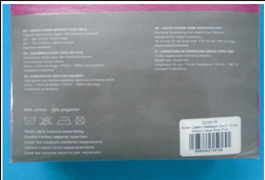
BACK INSERT VIEW