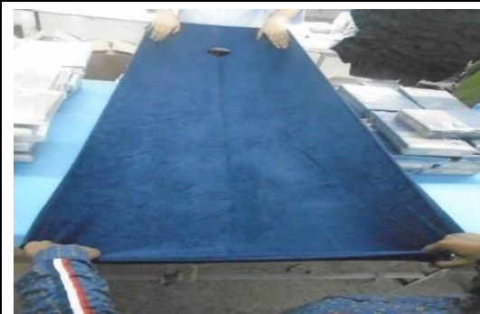
PRODUCT OPEN VIEW